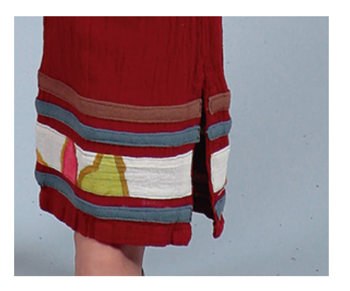
MP.216 TEKI 1, 2, 3