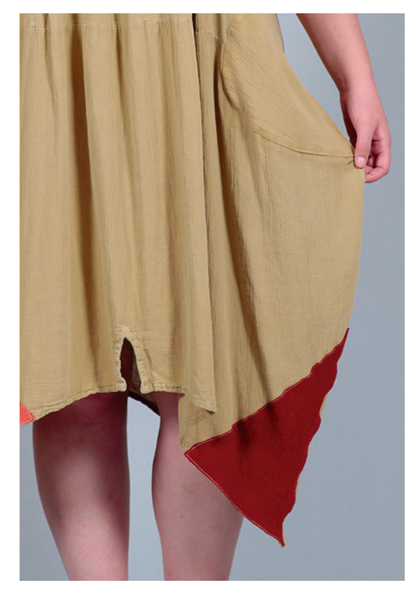
MV.314 NIYÉ ANY SIZE