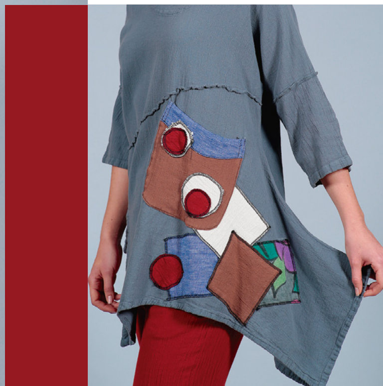
MB.133 METZA 0, 1, 2, 3