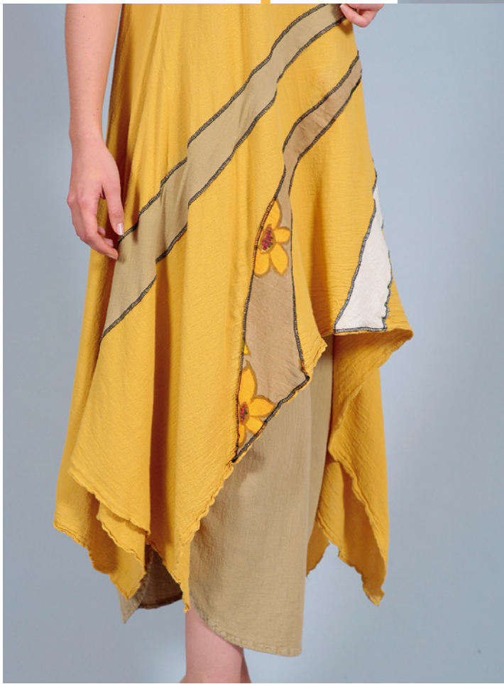
MB.129 HURU 0, 1, 2, 3