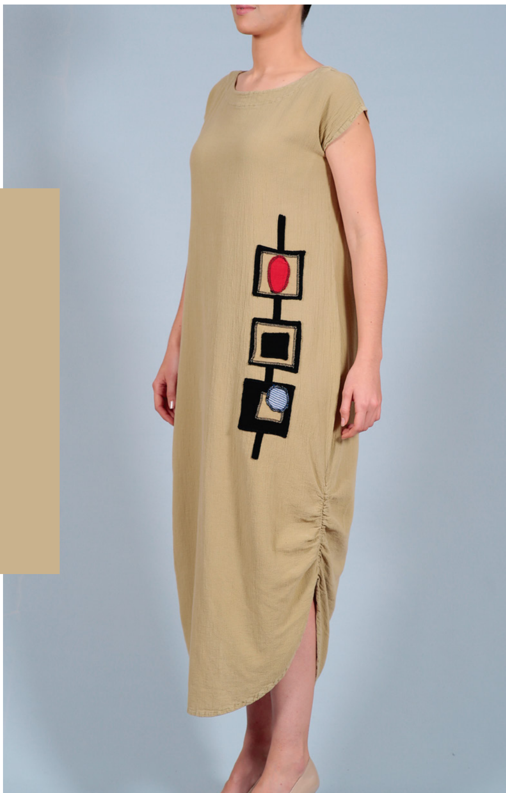
MV.315 RAIKA 0, 1, 2, 3