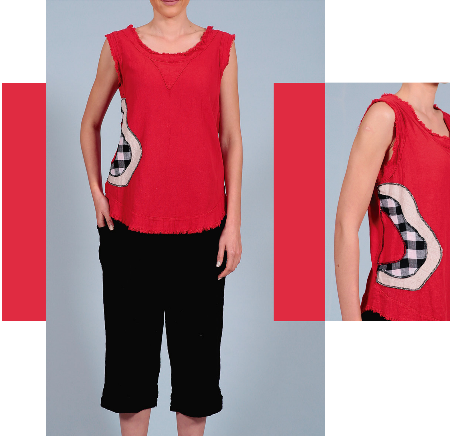
MB.136 TAHO 0, 1, 2, 3