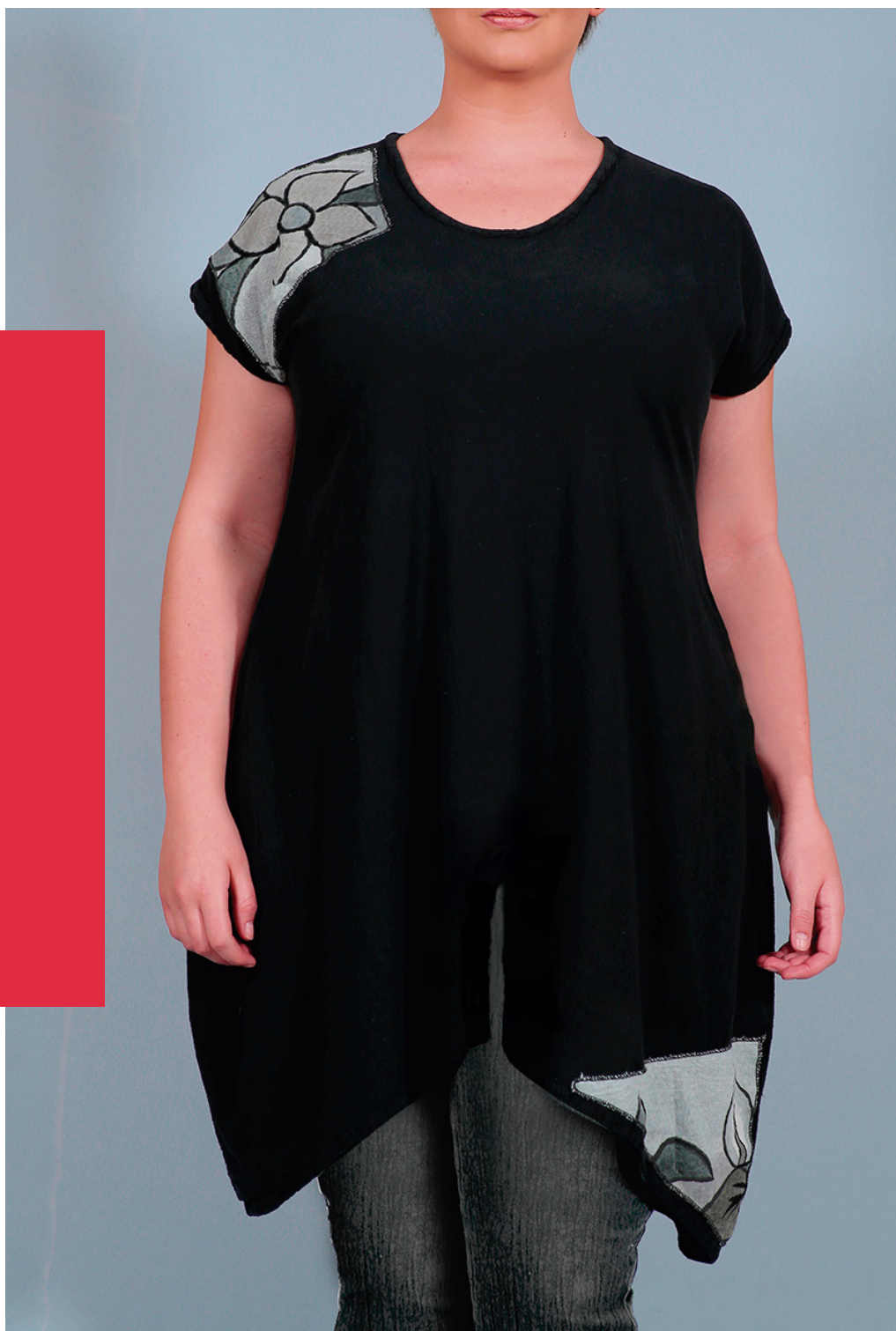
MB.159 BELL 0, 1, 2, 3