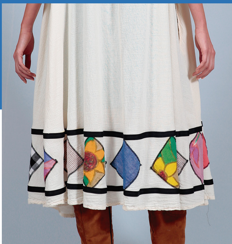
MS.409 TAJARI ANY SIZE