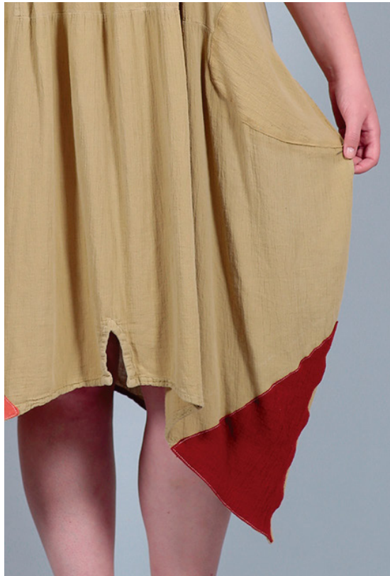
MV.314 NIYÉ ANY SIZE