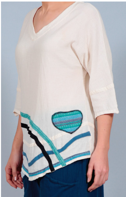
MB.137 TAUMARY 0, 1, 2, 3