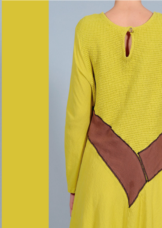
MB.130 IYARI 0, 1, 2, 3