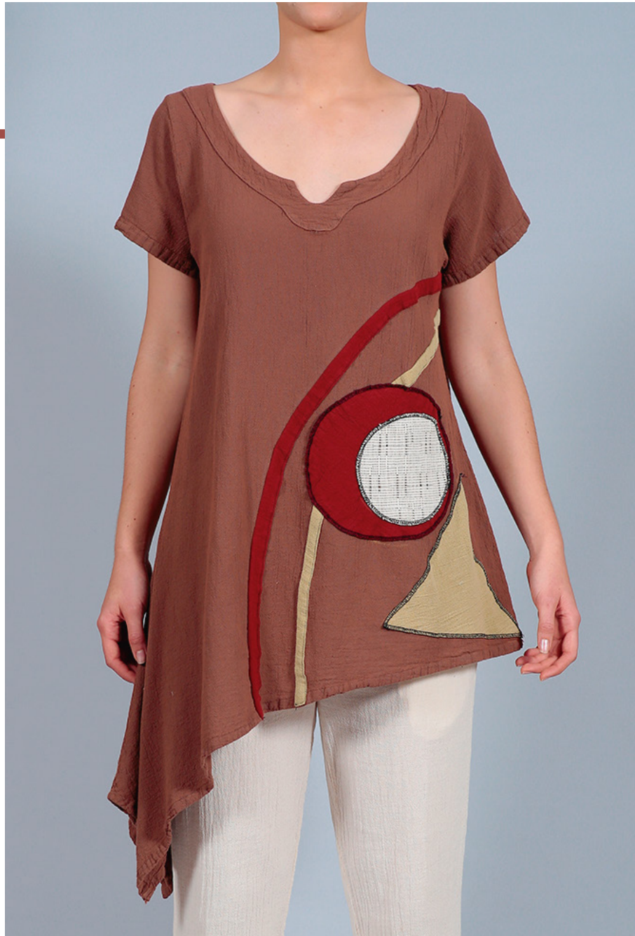
MB.139 TOPI 0, 1, 2, 3