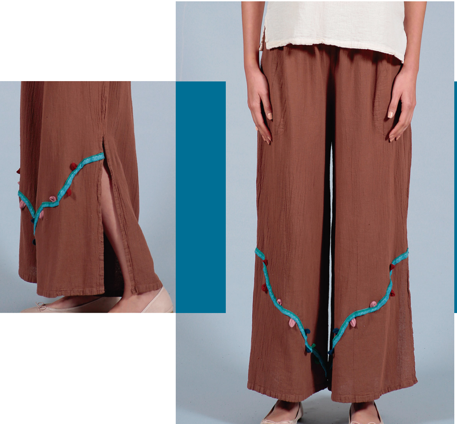
MP.214 JERI 1, 2, 3