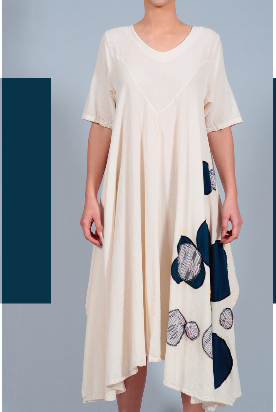
MV.317 TOTO 1, 2