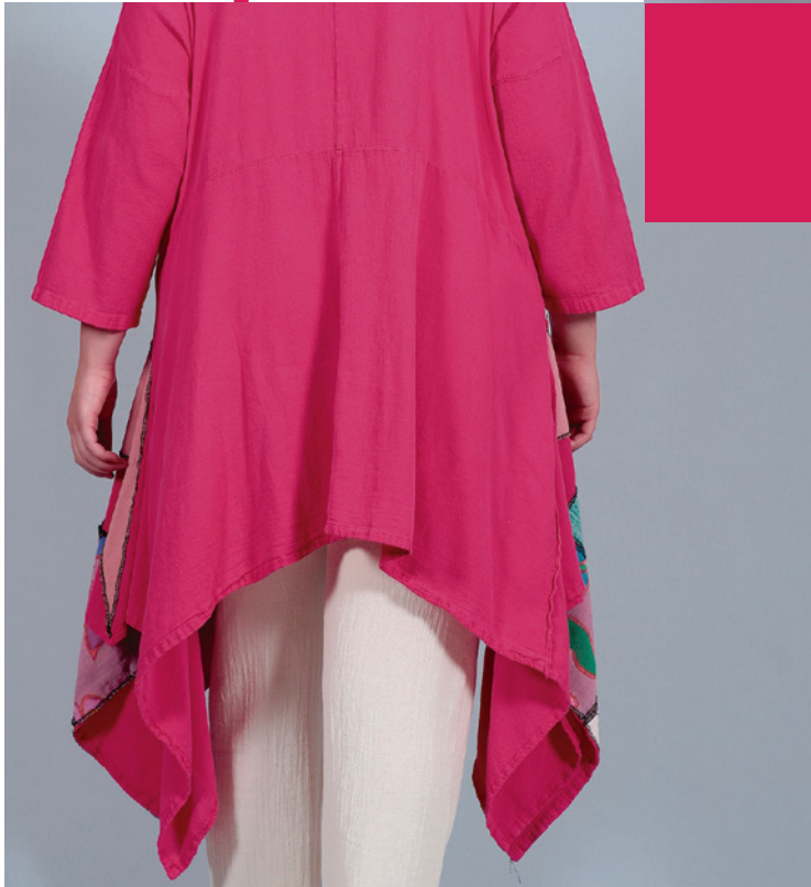
MB.134 NAKAWÉ ANY SIZE