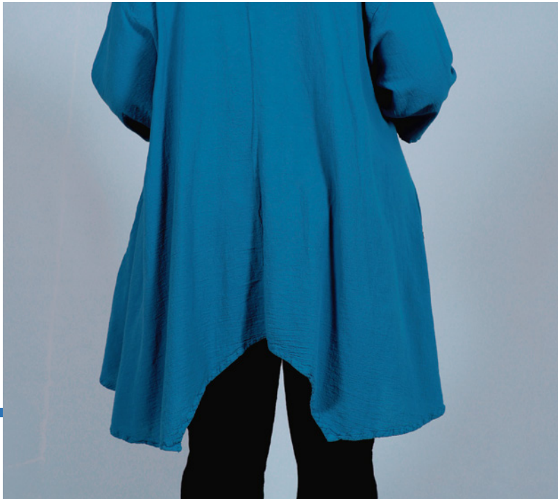
MB.131 KUPA ANY SIZE