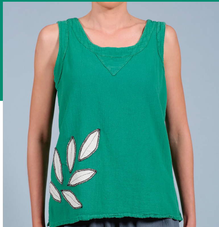
MB.132 MAXÁ 0, 1, 2, 3