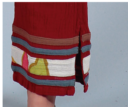
MP.216 TEKI 1, 2, 3