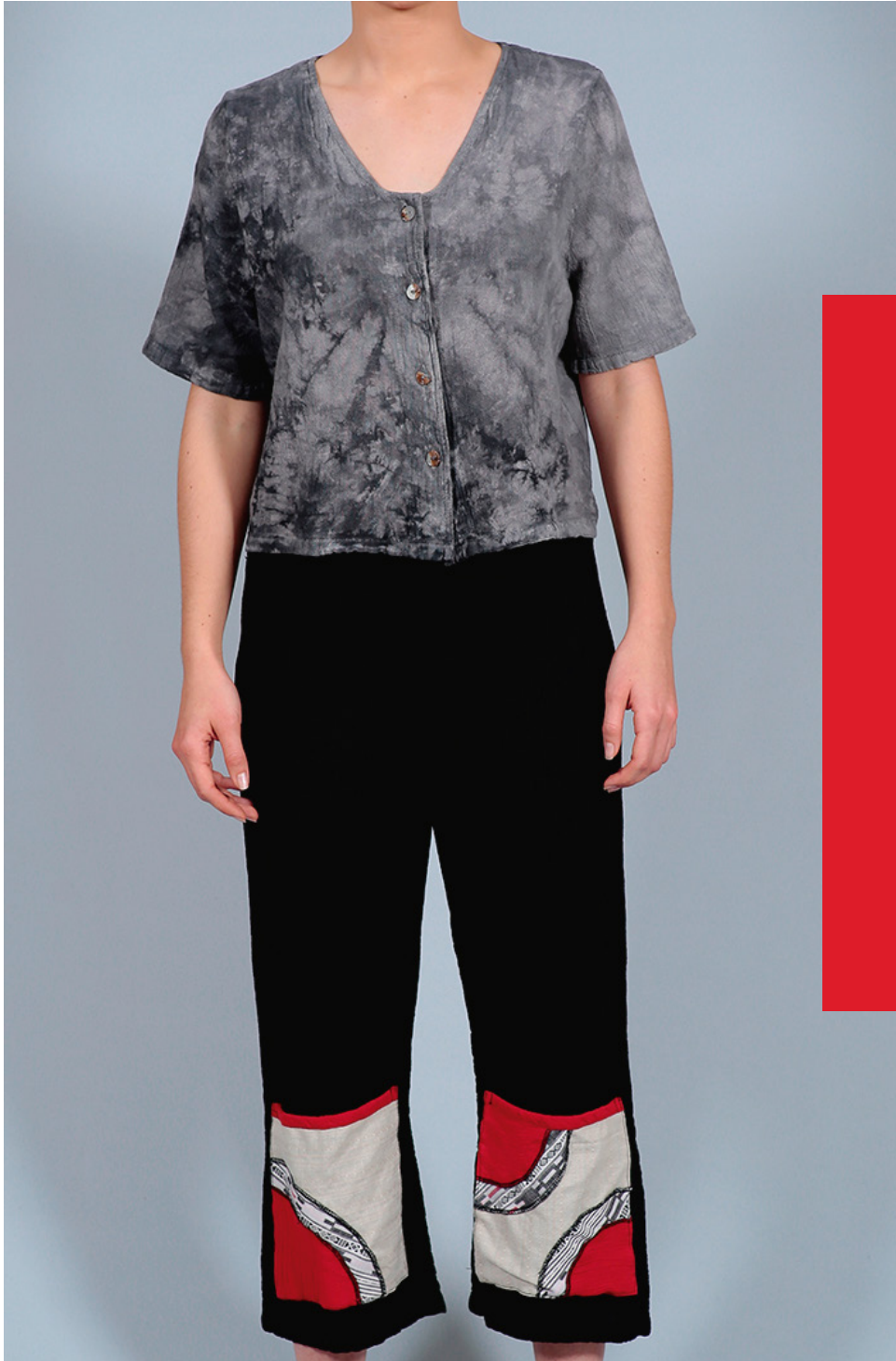
MP.215 COLLI 1, 2, 3