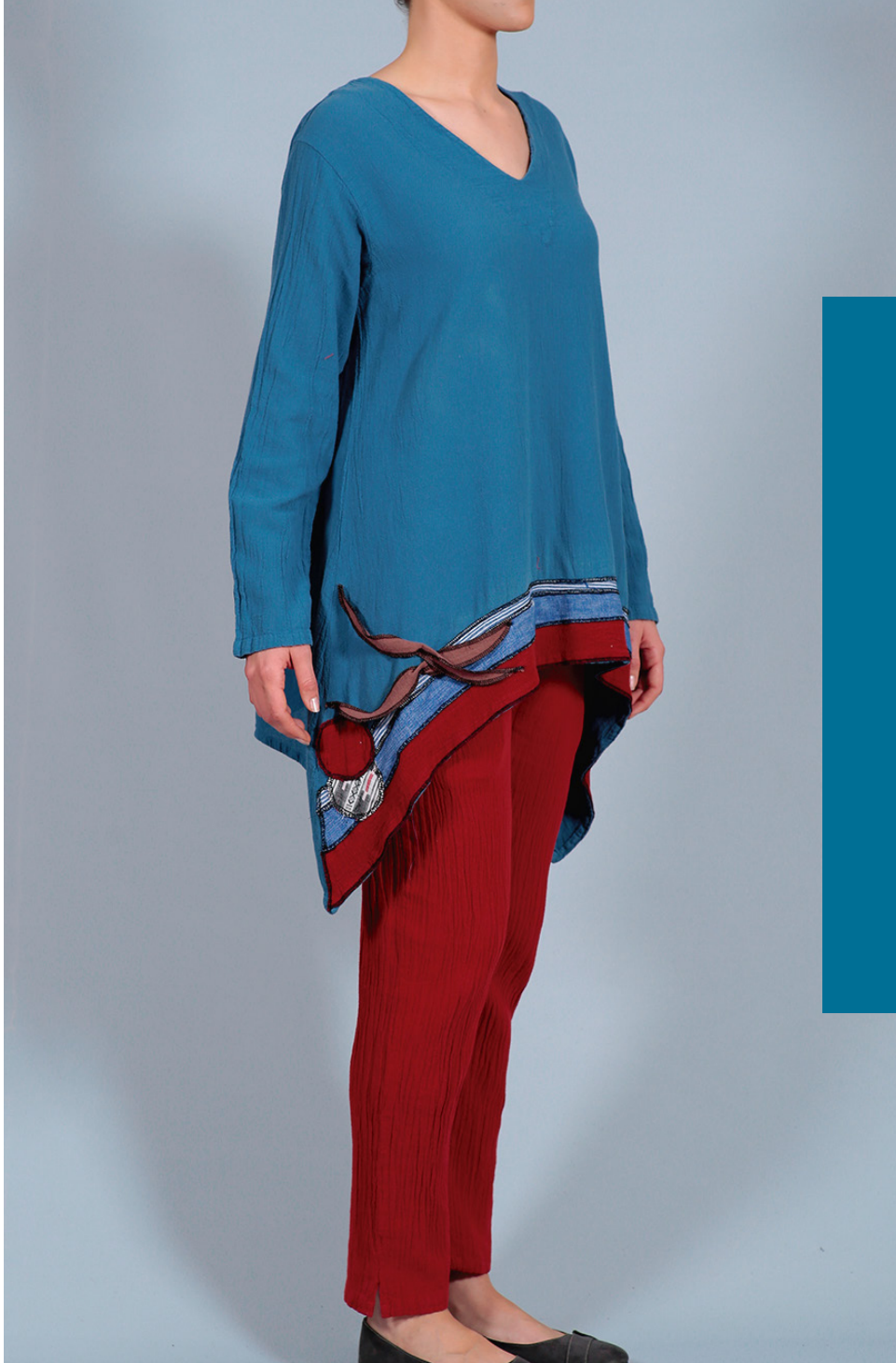
MB.127 CUIMARI 0, 1, 2, 3